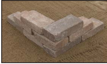
Tan & Brown