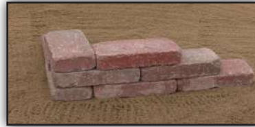
Rust (Red & Brown)