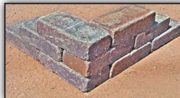
#7 Purple & Brown