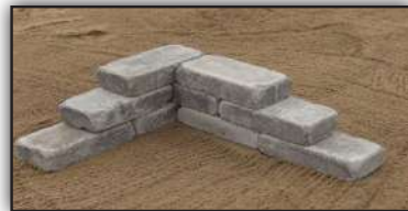
Charcoal (Black & Gray)