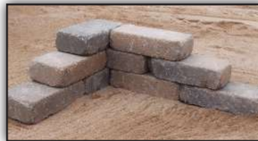
#5 Buff & Black