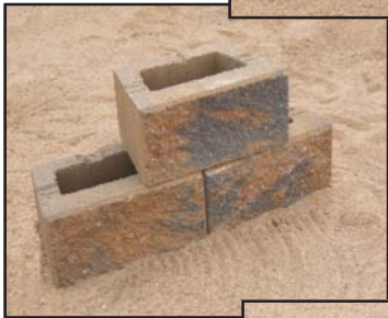
Red & Black*