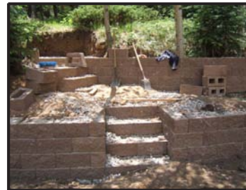
Shown above is an example of two 90° turns, incorporating 8" tall steps.